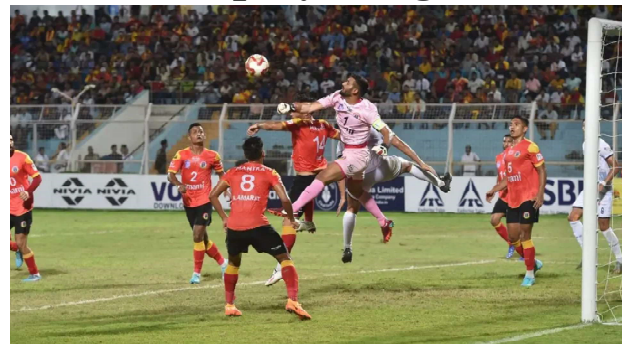
Action during East Bengal vs Rajasthan United match at Durand Cup 2022.