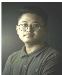
By: Thokchom Stalin

ITY for nearly twenty years until, in 1687, he published his book, THE PRINCIPIA: MATHEMATICAL PRINCIPLES OF NATURAL PHILOSOPHY. The incident of the falling apple was just the beginning of a thought that continued for decades. Newton isn't the only one to wrestle with a great idea for years. Creative thinking is a process for all of us.